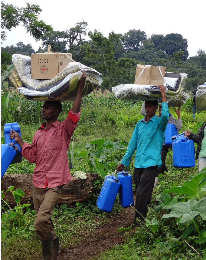
Together with the Ethiopian Red Cross Society, the ICRC distributes much needed basic household items to people having fled violence to the Gambella Region.

The ICRC and the ERCS jointly provide support to people affected by inter-communal clashes in different regions of the country.