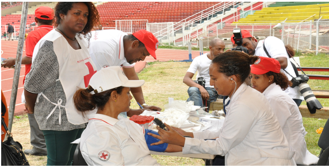
The General Secretary of the ERCS is donating blood to the National Blood Bank at the Addis Ababa Stadium on the occasion of International Red Cross Day, on May 8th.