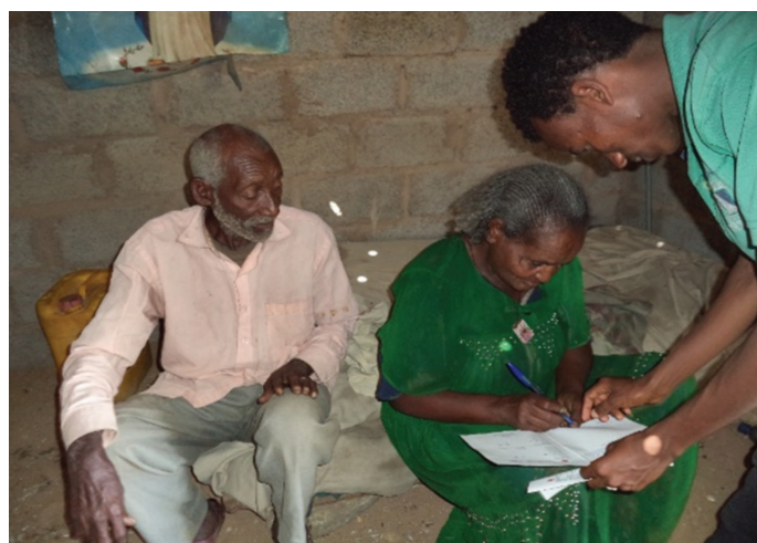
An old couple in Mekelle, Tigray, is writing a Red Cross message to their daughters in Eritrea, from whom they have been separated for years, with the support of ICRC and ERCS.