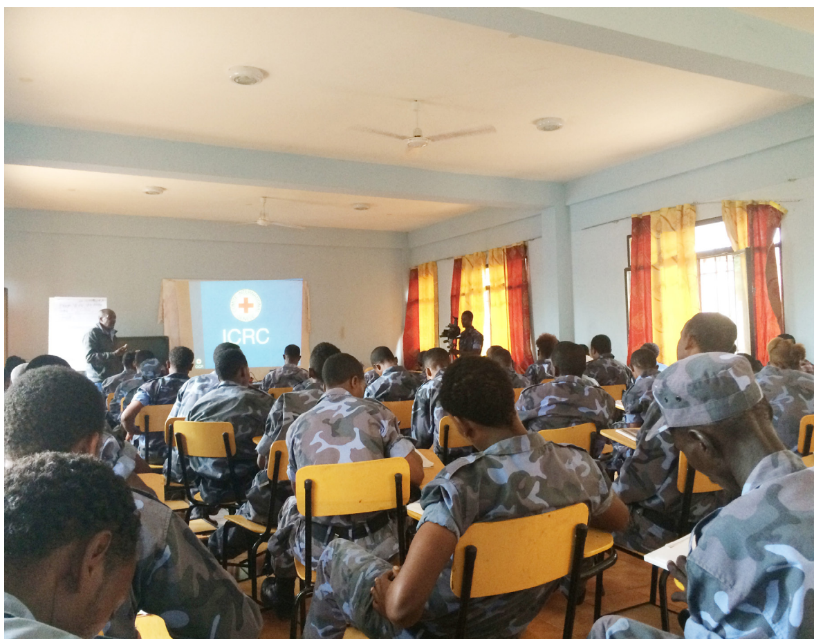
ICRC training of members of the Federal Special Force on international standards on the use of force and firearms.